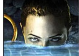
A bare 'Beowulf'