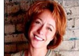
Paige back to 'Spaces'