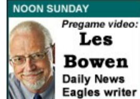
Leave a question for Les