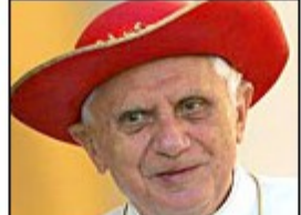
Why pope won't visit